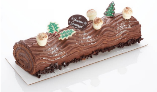
Decor is included.